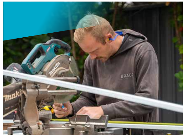
CARPENTRY & MAINTENANCE