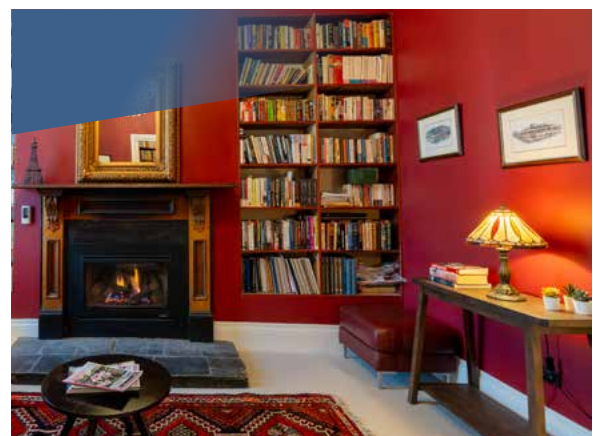
INTERIOR DESIGN & COLOUR CONSULTING